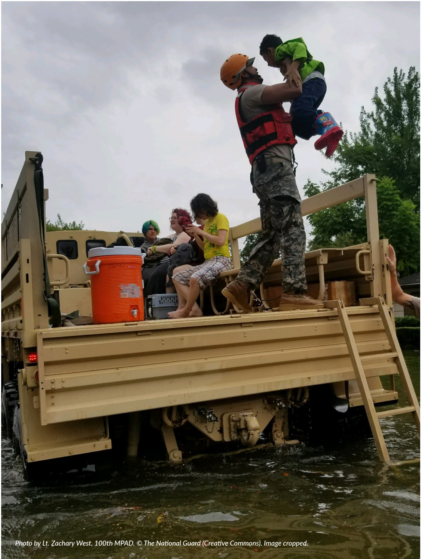
Photo by Lt. Zachary West, 100th MPAD. © The National Guard (Creative Commons). Image cropped.